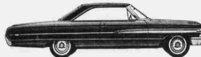
'64 Super Torque Ford—hundreds of pounds heavier, it's smoother, stronger than any in its field!

But words alone can't tell you how much Fords have changed. You have to test-drive the cars themselves. The seat of your pants may not be very scientific... but you'll get the message!