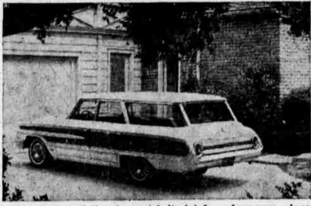
New luxury styling to match its total performance gives a bright, new look to the lineup of Ford cars for 1964. The top-selling Ford Galaxie 500 Series offers three distinctive new roof lines including the 4-door sedan (top photo). Five engines and four transmissions are offered including the Cruise-O-Matic Dual Range three-speed automatic transmission now available with all engines up to 390 cubic inches displacement.