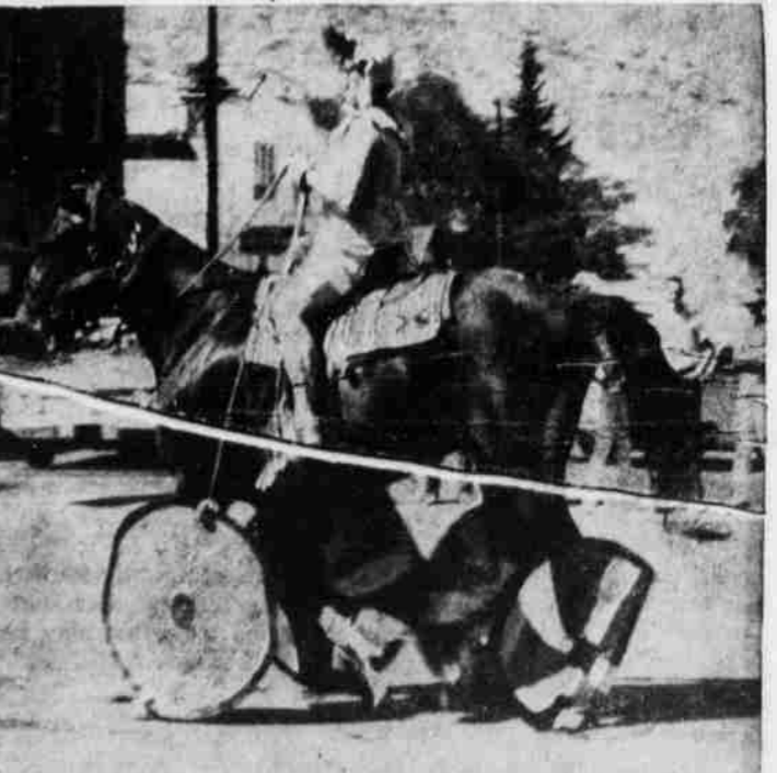
FUN AND FROLIC ARE A PART OF THE FAIR AND RODEO PARADE.

Sponsored As A Public Service For Welcome To Morrow County Edition By KINZUA CORPORATION