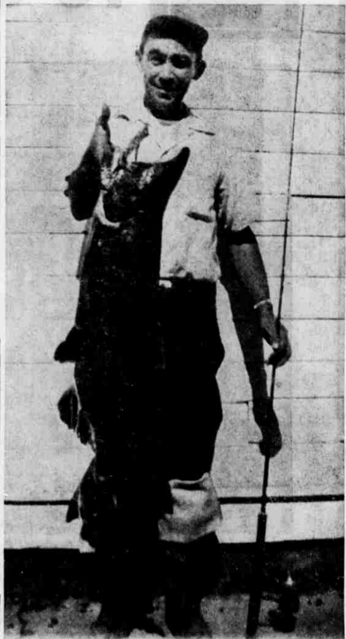
JOE TATONE, FORMER MAYOR OF BOARDMAN, HOLDS A WHOPPING BIG SALMON THAT HE CAUGHT IN THE COLUMBIA RIVER.