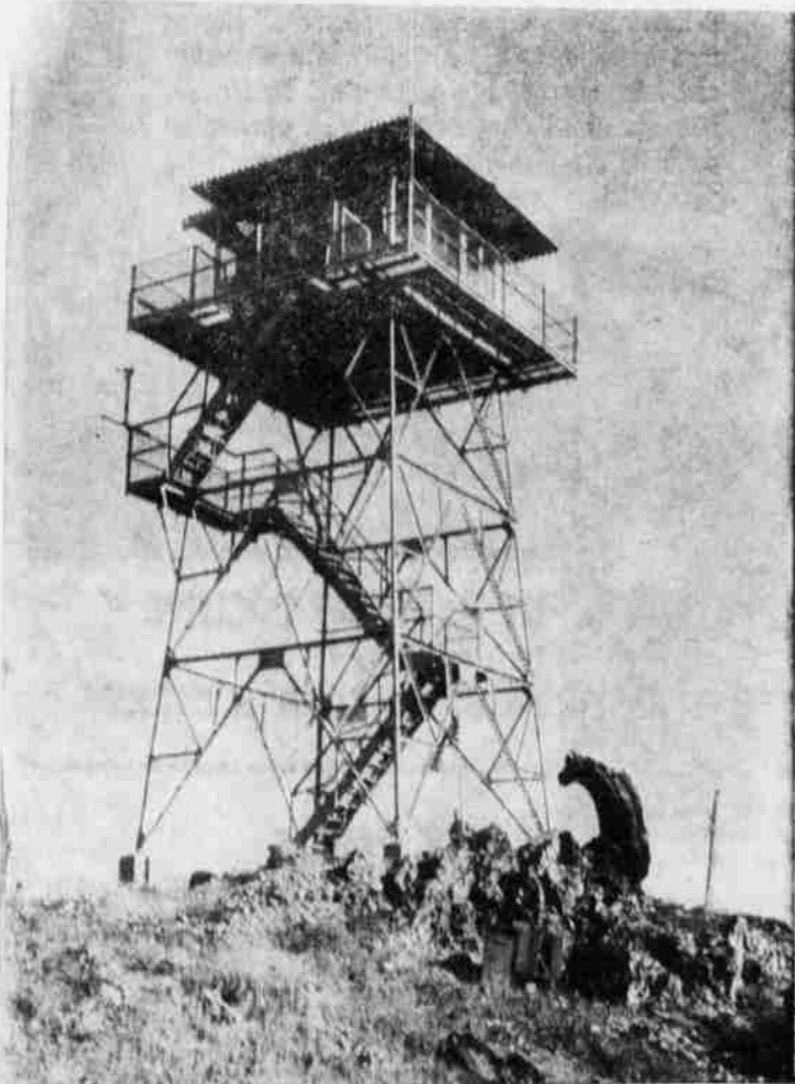
LOOKOUT TOWERS GUARD OVER THE HEPPNER RANGER DISTRICT, UMATILLA NATIONAL FOREST. THIS ONE STANDS HIGH ON MADISON BUTTE.