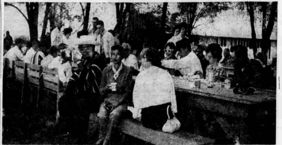
ONE OF THE PLEASANT EVENTS OF ANY YEAR IS THE WRANGLERS' COWBOY BREAKFAST HELD AT RODEO TIME. IT ATTRACTS HUNDREDS OF HUNGRY CUSTOMERS.