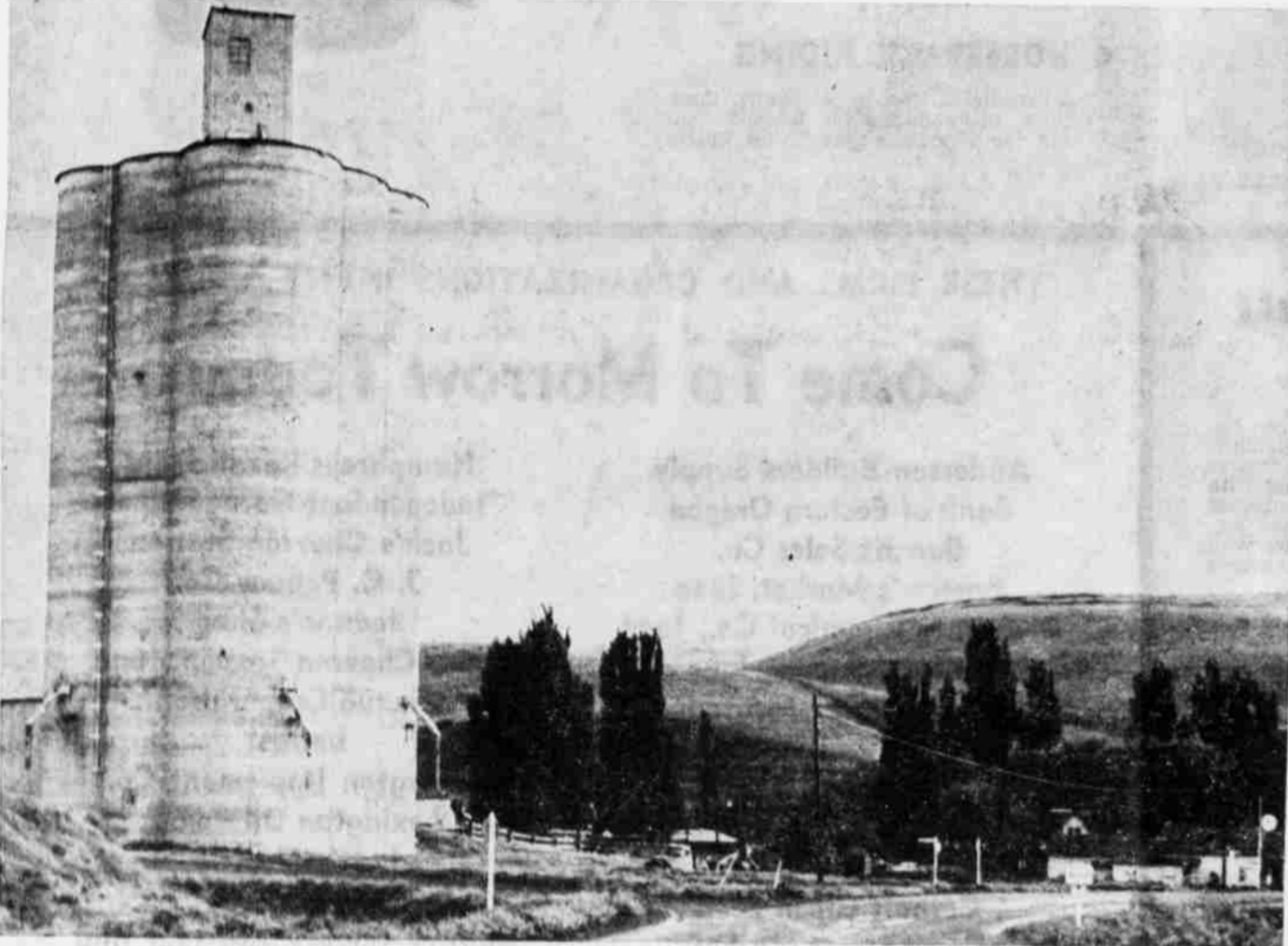
THE LITTLE COMMUNITY OF RUGGS NESTLES COZILY AMONG ROLLING HILLS WITH THE BIG MORROW COUNTY GRAIN GROWERS ELEVATOR TOWERING BESIDE IT.