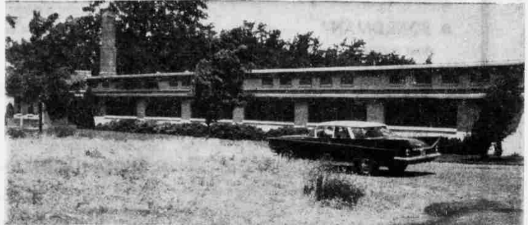
A. C. HOUGHTON SCHOOL, IRRIGON, IS ONE OF THE EXCELLENT ELEMENTARY SCHOOLS IN THE COUNTY.