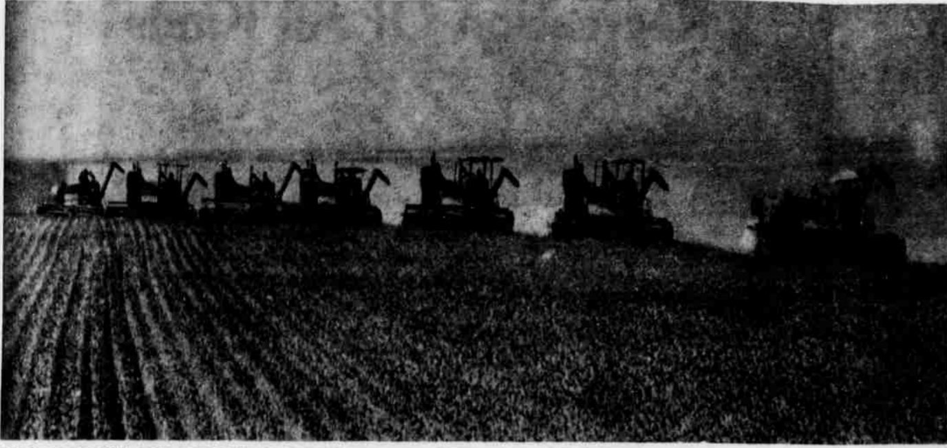
SEVEN COMBINES JOIN TO MAKE QUICK WORK OF HARVESTING A WHEAT FIELD.