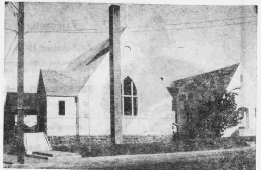
ALL SAINTS' EPISCOPAL CHURCH, HEPPNER, IS ONE OF MANY DENOMINATIONS REPRESENTED IN THE COUNTY.