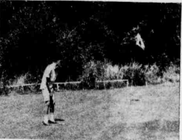
YOUNG AND OLD ENJOY WILLOW CREEK GOLF COURSE

Developed by members of the Willow Creek Golf club, a sporty 9-hole golf course is located at Heppner. Though short, it is a beautiful layout and furnishes enjoyment for young and old. Willow creek winds its way through green fairways and adds to the hazard of the layout. Visitors may play by observing the rules posted at the course and by paying the small green fee.