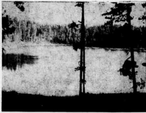
A VIEW OF BULL PRAIRIE RESERVOIR

Located just outside the county, 3 miles off the highway (207) to Spray and 39 miles from Heppner is the new Bull Prairie reservoir developed as a recreational project. State of Oregon constructed the dam that impounds a lake of 25 surface acres. It also stocks the lake with trout. Heppner Ranger district, U. S. Forest Service, maintains the forest camp and is developing the grounds. There are areas for camping, including trailer space, and for picnicking. Boats may be used, but no motors. A boat ramp is being built and a swimming beach will be provided. The beautiful spot, surrounded by forests, is expected to attract 25,000 to 30,000 visitors this year but never appears crowded.