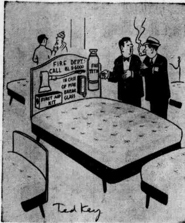
National Board of Fire Underwriters "NOW FOR THOSE WHO PREFER TO SMOKE IN BED . . ."