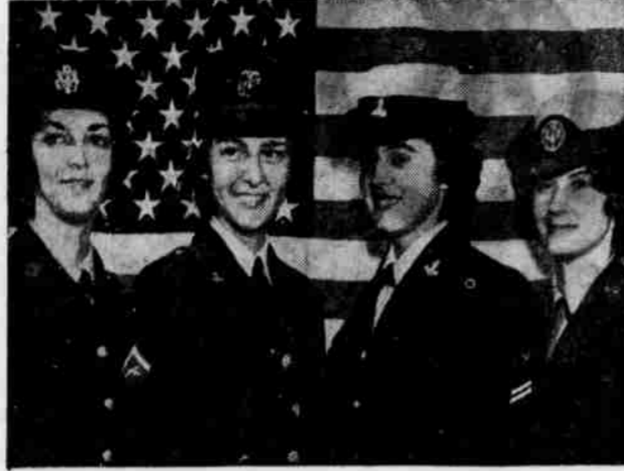
ARMED FORCES DAY 1963 —Supporting our combat forces are a group of dedicated, highly trained women in uniform who play an important part in the Nation's Defense Team. These four women represent the Army, Marine Corps, Navy and Air Force. There are approximately 32,000 women presently on active duty with the Armed Forces.