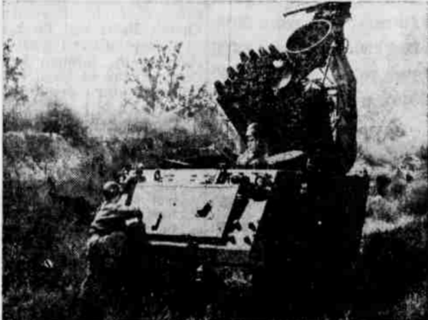
ARMED FORCES DAY 1963 —The Moulter which is the newest weapons system to join the U.S. Army's extensive arsenal is a forward area Air Defense guided missile designed to be used against short range rockets likely to be encountered on future battlefields.