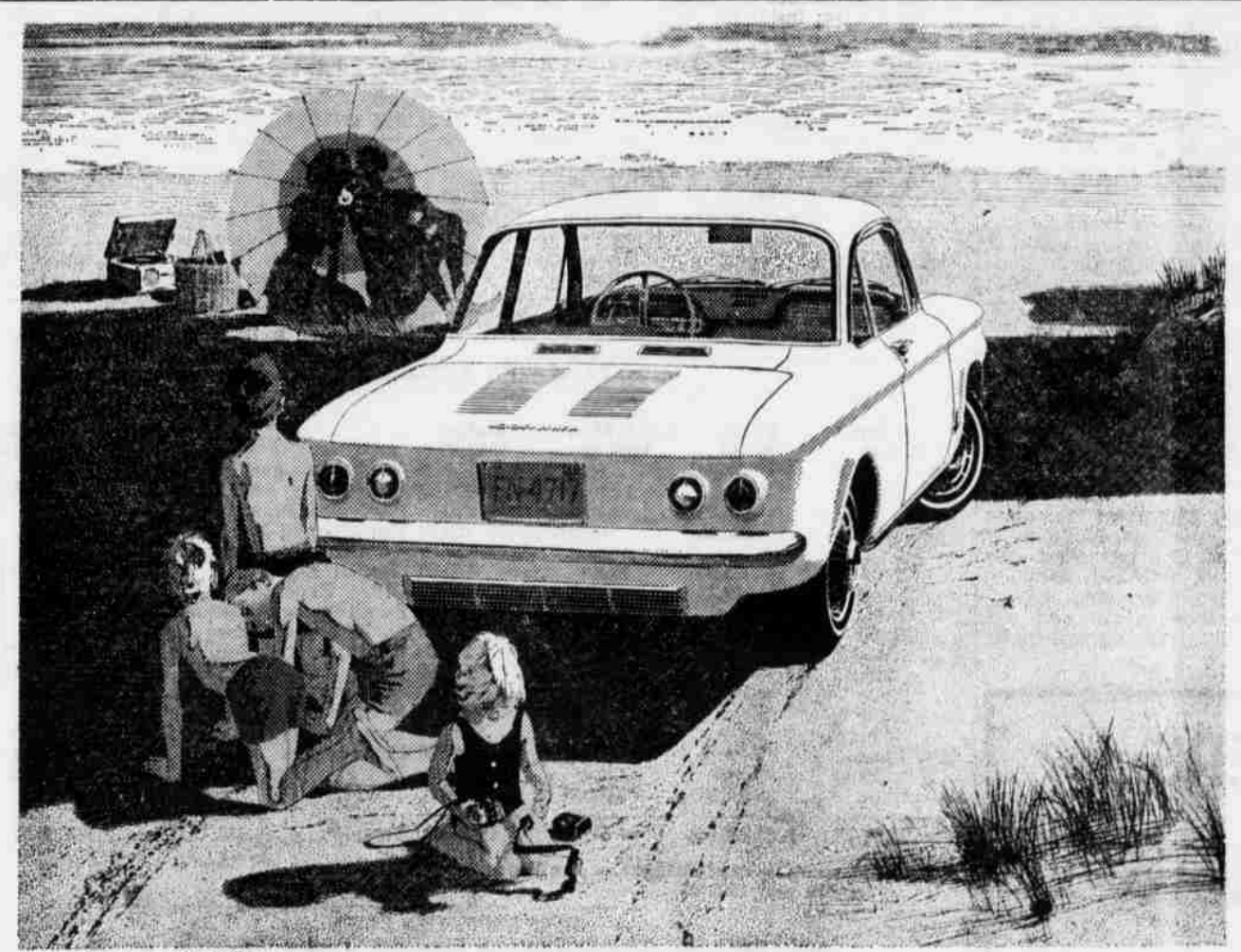
Corvair Monza Club Coupe

Do you know how easy it is to take a corner with a Corvair or park one? Turn this newspaper sideways and it will give you a pretty good idea. The wheel handles just about that easily. The Corvair's engine is in the rear, for