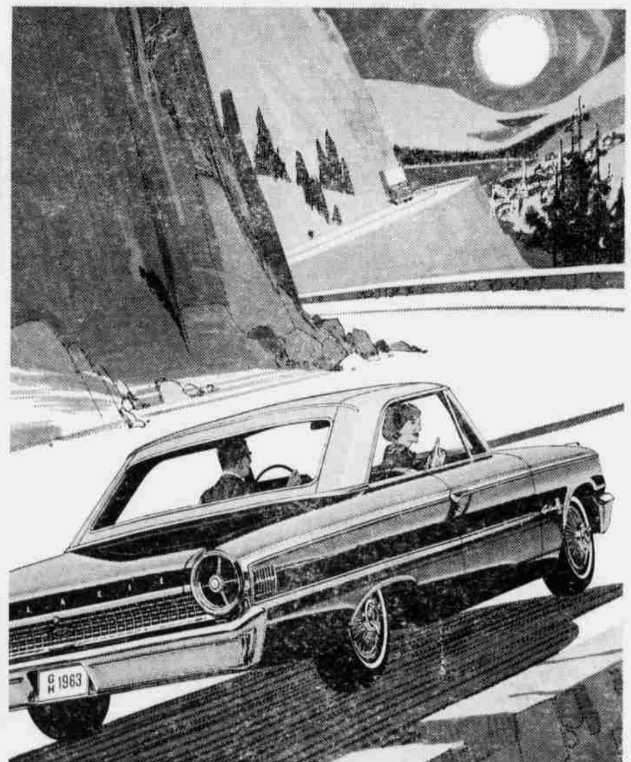
FORD GALAXIE 500/XL SPORTS HARDTOP

YOU'LL KNOW WHY SHE DOESN'T FEEL THE BUMPS...WHEN YOU TEST-DRIVE FORD'S NEW $10,000,000 RIDE