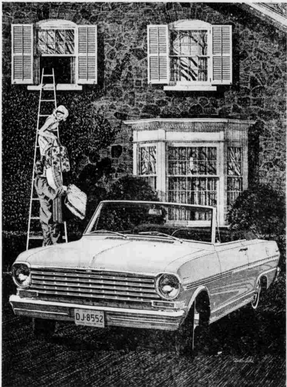
Chevy II Nova 400 SS Convertible above. Also available as SS Coupe, Super Sport equipment optional at extra cost. Also a choice of 10 regular Chevy II models.

NOW SEE WHAT'S NEW AT YOUR CHEVROLET DEALER'S