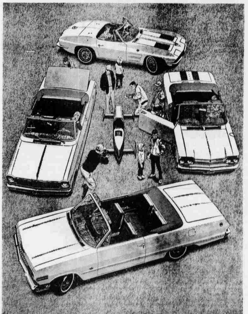
Models shown clockwise: Corvette Sting Ray Convertible, Corvair Monza Spyder Convertible, Chevrolet Impala Super Sport Convertible, Chevy II Nova 400 Super Sport Convertible. Center: Soap Box Derby Racer, built by All-American boys.

NOW SEE WHAT'S NEW AT YOUR CHEVROLET DEALER'S