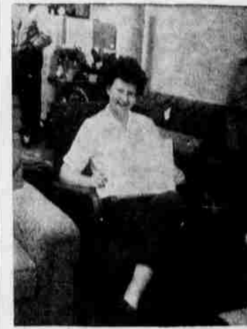
FIRST PRIZE WINNER

We wish to thank everyone who had a share in making our Grand Opening such a fine success. We extend special thanks to businesses for the lovely flowers.