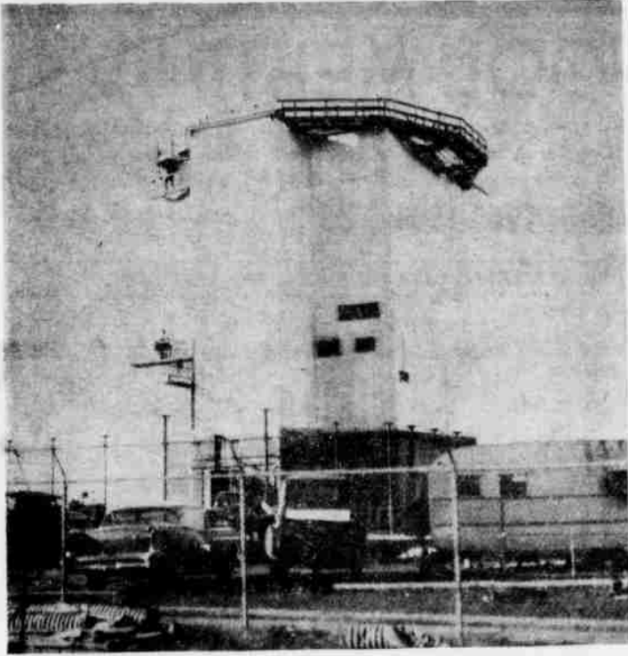
CONSTRUCTION continues on the FPS-27 radar tower at Condon Air Force Station. The tower has reached the fifth floor level which will house the radar antenna in a bubble shaped dome enclosure. The Jen-Mar Construction Company of San Diego, Calif., holds the contract for construction of the tower.