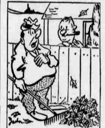
"Had a realistic vision just now.... here I was raking in all that dough I'll get out of U. S. Savings Bonds."

Willows Grange—Sunday, March 17, beginning with potluck dinner at noon.