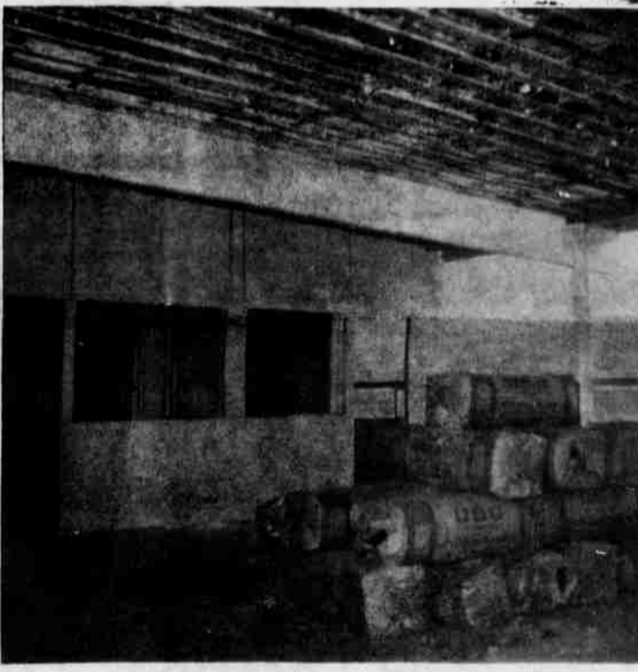
THIS INTERIOR VIEW of the new high school building shows present stage of progress. This is in the library of the building. Plasterboard is on walls and most of the insulation is in place in the ceilings. Rough electrical work has been done. Rooms will be well-lighted and spacious.

Heppner Rainbow girls will distribute coin containers in Heppner and will also hold lily sales on downtown streets the same date as in Ione.