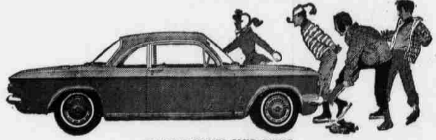
CORVAIR MONZA CLUB COUPE