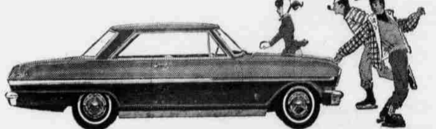
CHEVY II NOVA 400 SPORT COUPE