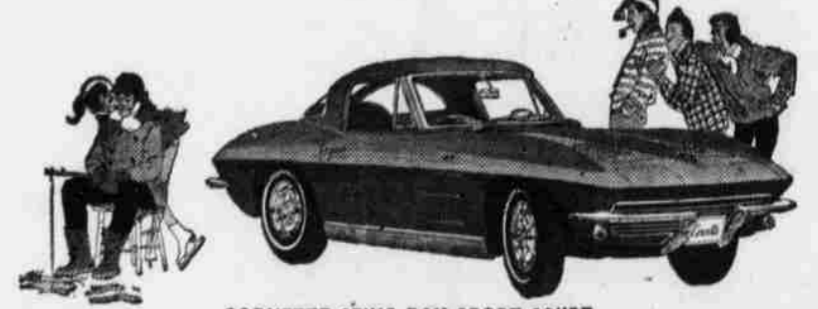
CORVETTE STING RAY SPORT COUPE

Now—Bonanza Buys on four entirely different kinds of cars at your Chevrolet dealer's