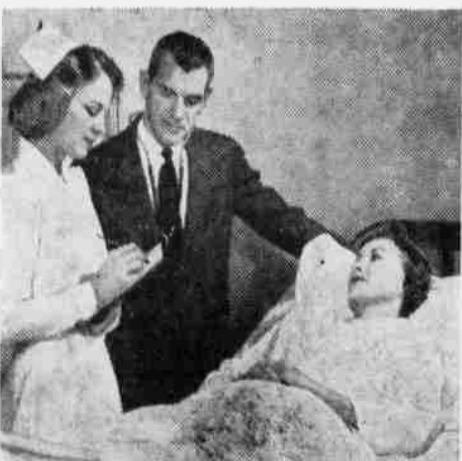
HOSPITAL EXPENSES have been going up at the rate of nearly 1% a month since 1950. An American Republic Plan can help pay these bills when you need money most.

On its record of paying claims—the most important way to judge any insurance company—American Republic ranks Number One among the "Top 40" firms in its field. The few minutes it takes you to learn about American Republic "Tailored" Protection may be worth hundreds of dollars to you—at a time when you may need every cent you can lay your hands on!