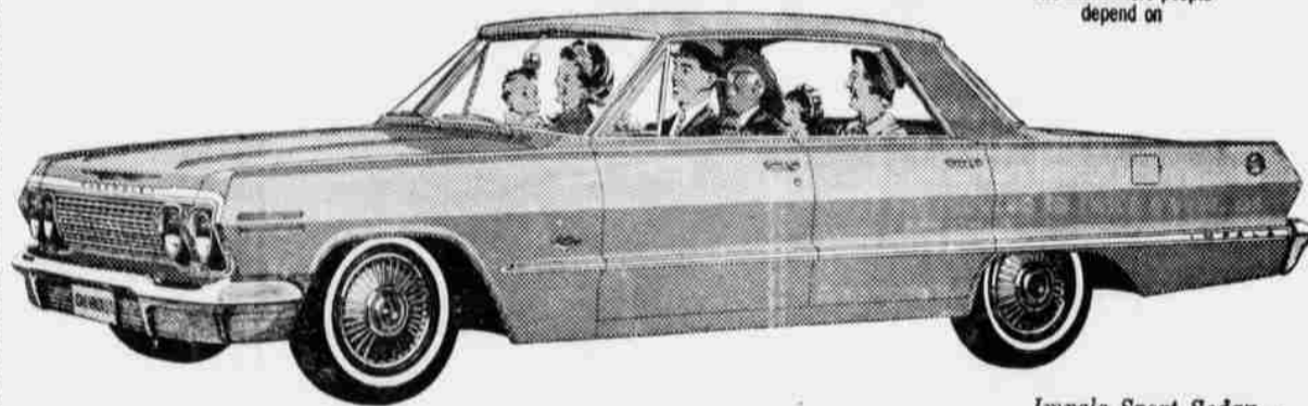
'63 JET-SMOOTH CHEVROLET

Impala Sport Sedan— one of 13 Jet-smooth Chevrolets