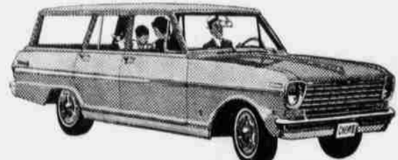
Chevy II Nova 400 Station Wagon— shares the easy-care features of the big Chevrolet