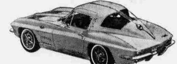
Corvette Sting Ray Sport Coupe— there's also a new Sting Ray Convertible

See four entirely different kinds of cars at your Chevrolet dealer's Showroom!