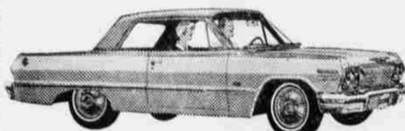
Chevrolet Impala Sport Coupe— beauty, ride and comfort you'll go for instantly

Impala Sport Sedan— one of 13 Jet-smooth Chevrolets