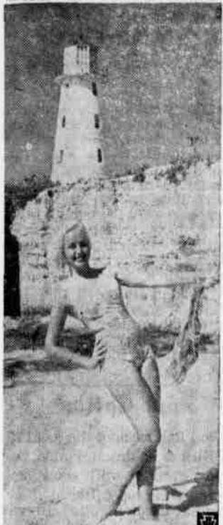
This trim Nassau vacationer is at the end of the line, but she doesn't seem grieved about it. She's probably got a boat on the other end, set to take her sailing beyond Nassau's harbor lighthouse.