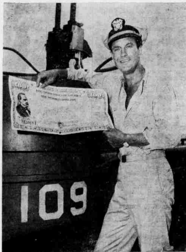
Actor who drew one of Hollywood's most sought roles—the portrayal of Lieut. John F. Kennedy in the Warner Brothers' movie "PT 109," the story of a heroic episode of World War II—says "Merry Christmas" to his many friends by urging them to give Bonds for Christmas.