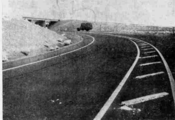
SOME LOCAL residents have called the new highway interchange at the bomb range road junction a "death trap." Tight curves limit visibility and traffic approaching from some directions has to cross opposing lanes of traffic. This view looks to northeast showing one of the tight curves. Truck visible in picture is coming off bomb range road and heading north. Some residents who are concerned about the matter believe that the hazard could be alleviated with a few moderate changes, although they had no success convincing the highway department before construction got underway. Advice to all motorists now is to drive very carefully at this junction. A later edition of the Gazette-Times will explain how modifications could be made.