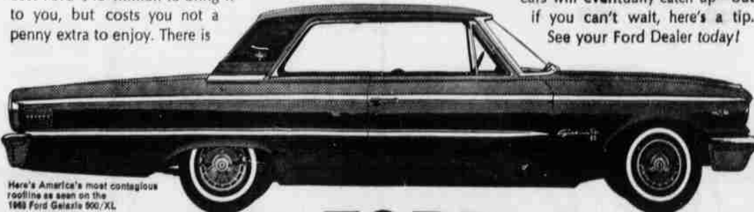
Here's America's most contagious roofline as seen on the 1963 Ford Galaxie 500/XL

Only Ford offers all these advantages now. Other cars will eventually catch up—but if you can't wait, here's a tip. See your Ford Dealer today!