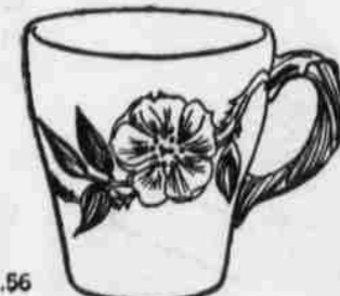
DESERT ROSE MUG REG. 1.95—SPEC. 1.56