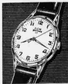
ELGIN SPORTSMAN. Here's an Elgin watch every man can afford. Long on features—short on price. 17-jewel, shock resistant, unbreakable mounting. Waterproof. Has a luminous dial. Sweep second hand. Priced at only $19.95.