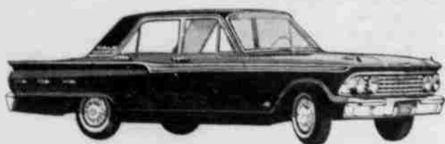
FAIRLANE 500... Right size... Right price... Right between compacts and big cars