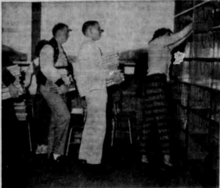
EVERYONE worked at moving day at the new lone High school Friday morning. Here students line up with loads of books from the old building, ready to place them on shelves in the new library. (Also see pictures on front page)

Heppner, Oregon, Thursday, December 28, 1961 Sect. II - 4 Pages