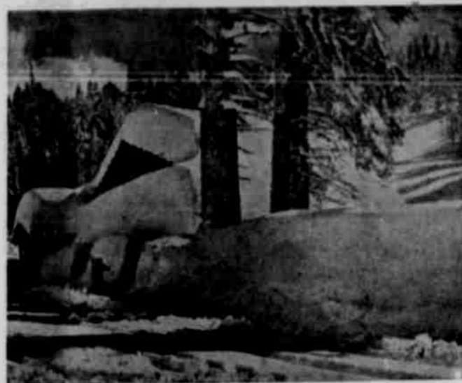
SNOW LAND... Like an imitation fairy-land is this mountain scene, but it's for real. It shows the ski house, sanctuary for snow lovers at Badger Pass, Yosemite National Park in California. The snow here reaches great depths but winter sports lovers are undaunted and log fires in the ski house are warm.