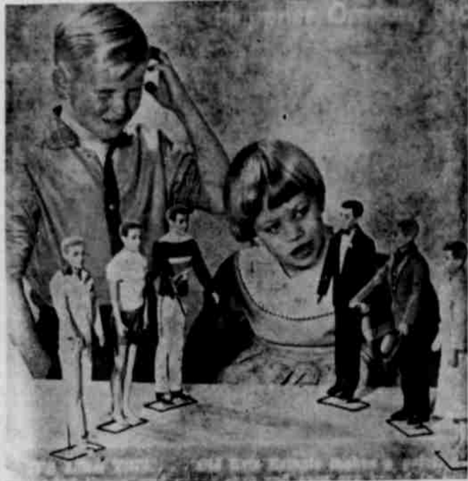
MIXED REACTIONS . . . The young lady seems pleased but the reaction of her young gentleman friend is a bit different. He isn't quite sure of his opinion regarding the new boy dolls on the holiday market this year as companion to more familiar girl-type dolls. "Well-I . . . if you like dolls. . ."