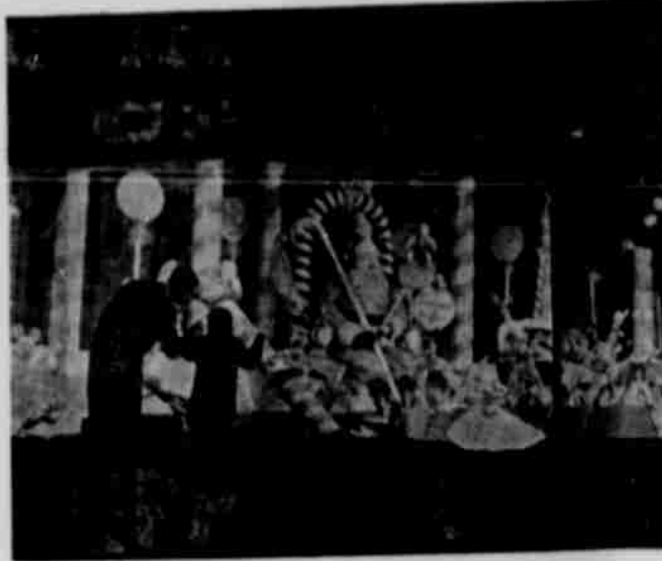
THERE'S SANTA . . . Father and son pause in their window shopping to inspect Santa Claus surrounded by huge candy canes in window of Chicago department store. Boy! Get a load of those lollipops, pop. They'd last a fellow an awfully long time!