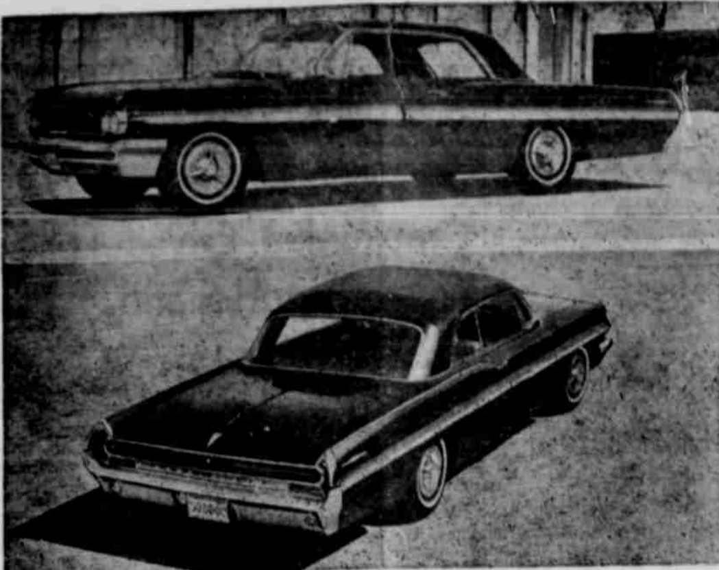
LUXURIOUS STYLING of Pontiac's 1962 sports coupe models is graphically illustrated by these views of the sparkling new Bonneville. A smaller rear window and a lower roof design give this two-door hardtop the rakish look of a softtop convertible. A divided V-shaped grille of horizontal bars exemplifies the smooth flowing lines and the Bonneville's generous full-length side moulding accentuates the car's long, low and sleek appearance. This same new look in hardtops is found in the Catalina sports coupe.