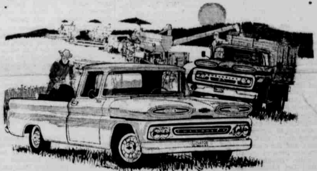
Fleetside Pickup and Series 80 with high rack

Pessing are just average people who can't kid themselves.