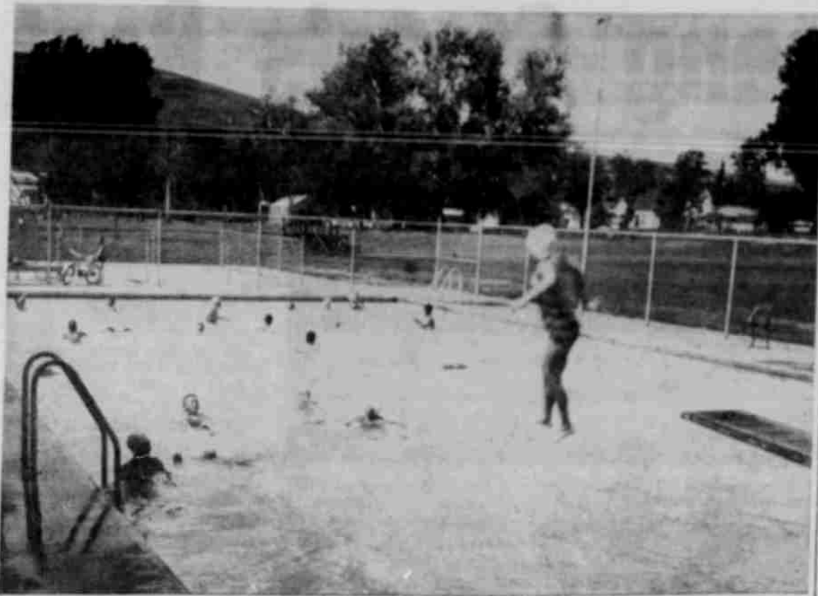
NOTHING COULD be more wonderful on a hot day than a dip in this school swimming pool at Ione. It is an ultra-modern pool with underwater lights and similar facilities. For a small admission fee, anyone can enjoy a swim. Camera caught young girl jumping off the diving board.