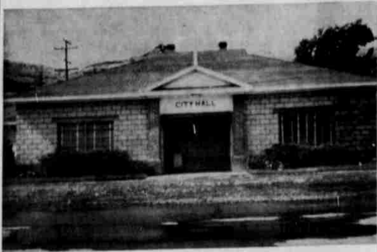
PRESENTING a neat and trim appearance is this concrete block building, the lone city hall.

Morrow county is favored with ideal weather. Also, our taxes are comparably low, and we have plenty of room to build and expand. We would like to see someone establish a tourist attraction similar to the Knott's Berry Farm in California. Since we are located near the "Old