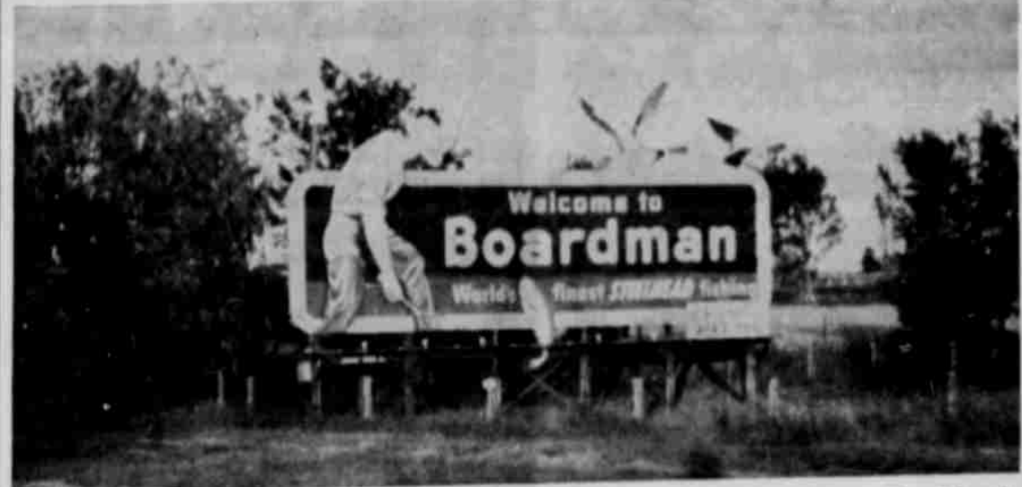
'WORLD'S FINEST Steelhead Fishing,' declares this sign at the edge of Boardman. The Columbia River is being developed there as a great recreation center, providing water skiing, boating, fishing and other water sports.