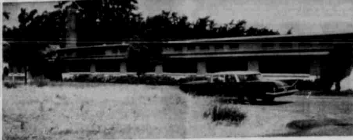
A. C. HOUGHTON School at Irrigon is one of the impressive buildings in that area and provides modern schooling for children there.