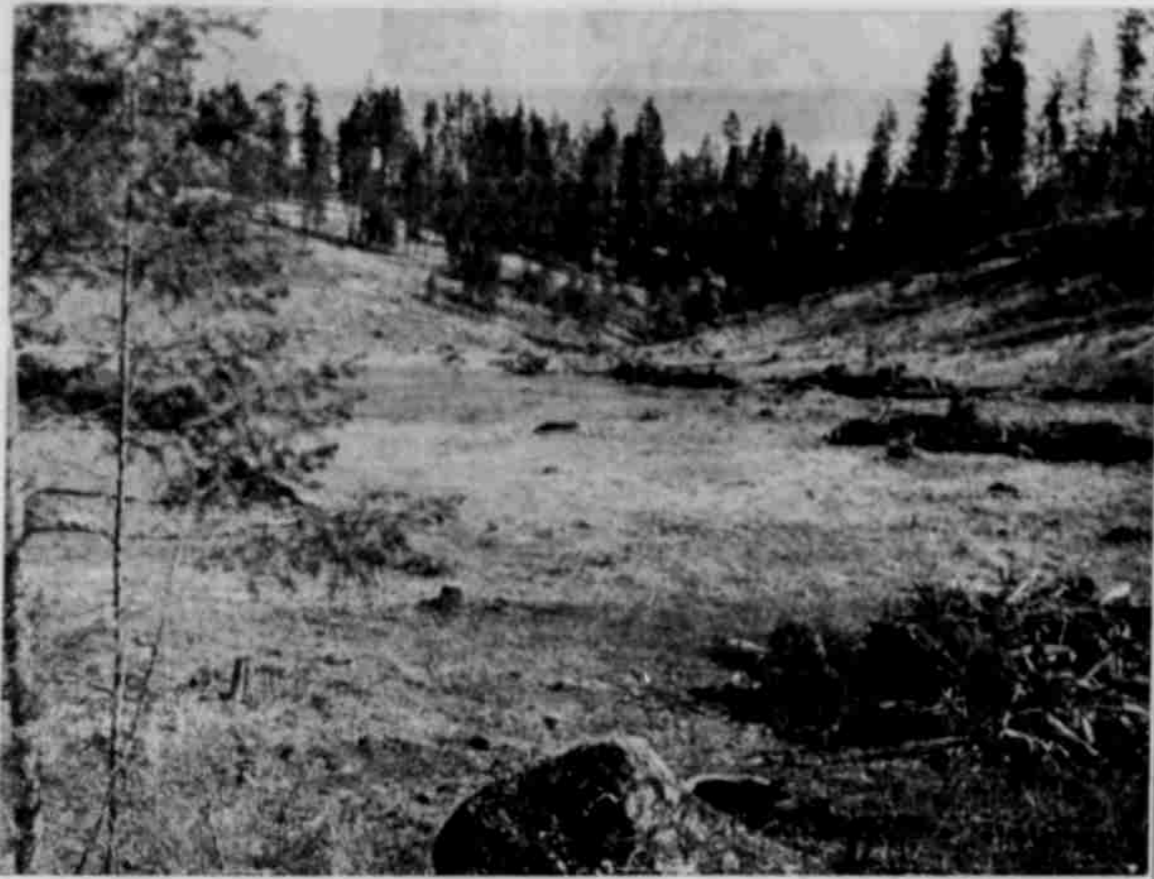
THIS IS THE site of Bull Prairie reservoir which is now under construction. The lake which will be formed on this site will be some 25 acres in extent and will provide all types of water recreation. Located near the Heppner-Spray highway, some 39 miles from Heppner, the area will include a 25-unit forest campground with stoves, tables, and water supply.

By Jackie Labhart Nestled in the rolling hills surrounding Heppner, and just a mile from the city limits, is a complete nine hole golf course; and winding throughout the entire links is picturesque Willow Creek on whose banks grow tall graceful willows and in whose waters swim the tastiest trout in Morrow county.