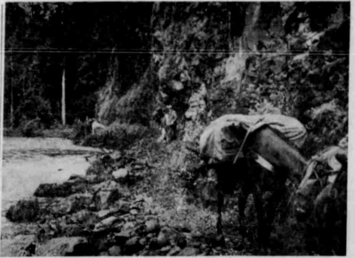
TYPICAL OF SCENE in rugged country in the Blue Mountains south of Heppner is this one from the U. S. Forest Service, showing a number of men packing in along a fast-moving stream.

If golfing is your "cup of tee" then Willow Creek Country Club has the ingredients.