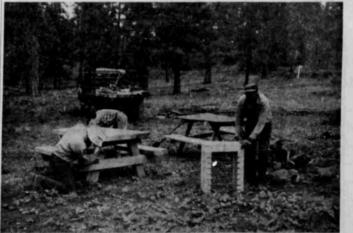
FINE CAMP SITES are located in the Umatilla National Forest where the pine woods are free from underbrush. Here foresters are shown setting up tables and camp fireplace at the Fairview Campgrounds, some 39 miles south of Heppner. This camp is equipped for 12 camping units.