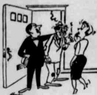
"Dear, you remember your old high school flame—"