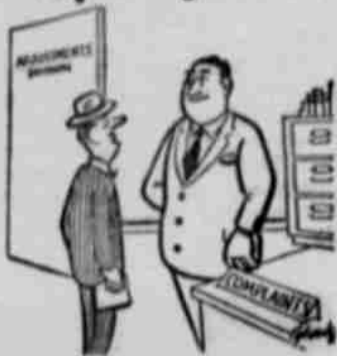
"Is there somebody more my size I can complain to?"

"Two of the biggest highway menaces are drivers under 25 going over 65 and drivers over 65 going under 25."—L. S. McCandles.