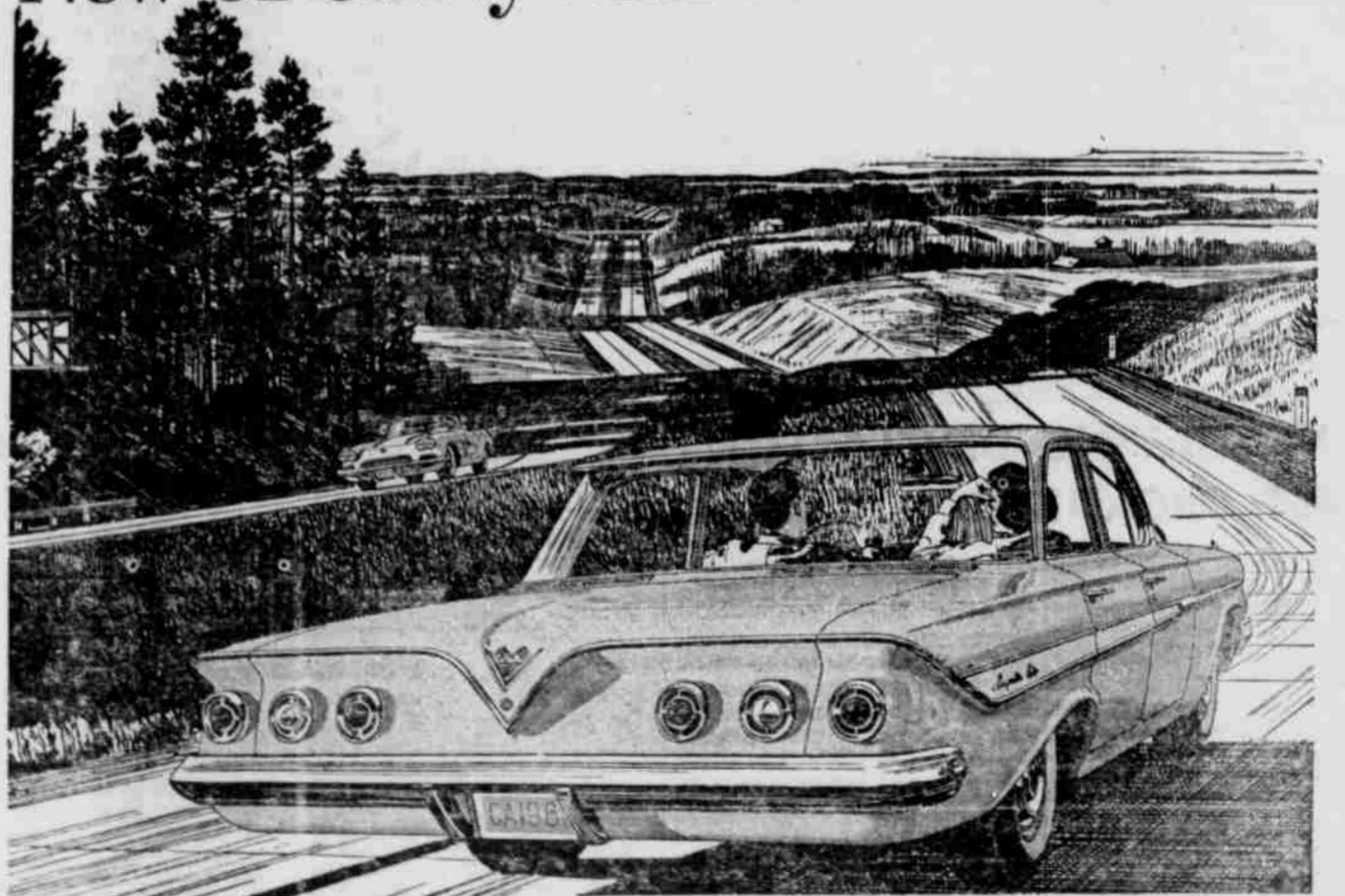
Impala 4-Door Sedan—Jet-smooth traveler that rivals the luxury cars in everything but price

The '61 Chevy loves to go because it goes so well. Purrs along pavements like a happy tabby. Takes rough roads in stride and all roads in style.