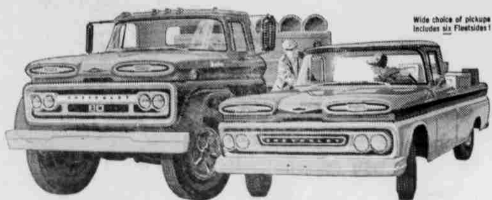
You've never seen a heavyweight handle so easily!

You actually feel the advantages of independent front suspension in the almost total absence of I-beam shimmy and wheel fight. The driver rides easy, the load's better protected, tires take less abuse, the whole truck is subjected to far less damaging road shock and vibration. Efficiency goes up. Profits follow. Look over the whole line—both types of Chevy trucks.