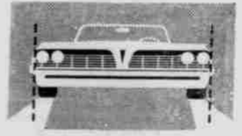
THE ONLY WIDE-TRACK CAR! Body width trimmed to reduce side overhang. More weight balanced between the wheels. No other car hugs the road with such sure-footed stability and precision.

More headroom, legroom, footroom for greater comfort! You'll take great comfort in the extra roominess we've built into the '61 Pontiac. Seats are higher, yet there's more clearance beneath the steering wheel and more hatroom over your head. There is more legroom, more footroom. Doors are wider and designed to swing open farther. The more highway you put behind you (Pontiac specializes in this) the more you'll appreciate the new room that's all around you in this sleek new '61.