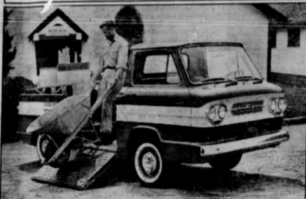
With an exclusive hinged side-loading ramp, the Chevrolet Corvair 95 light-duty truck offers economical operation, low loading height, easy handling and large cargo space for its size. It is powered by the rear-mounted 50-hp. air-cooled Corvair engine for low operating costs. On a 95-inch wheelbase, it has a loading height of 14 inches at the side gate and 28.5 inches at the rear.