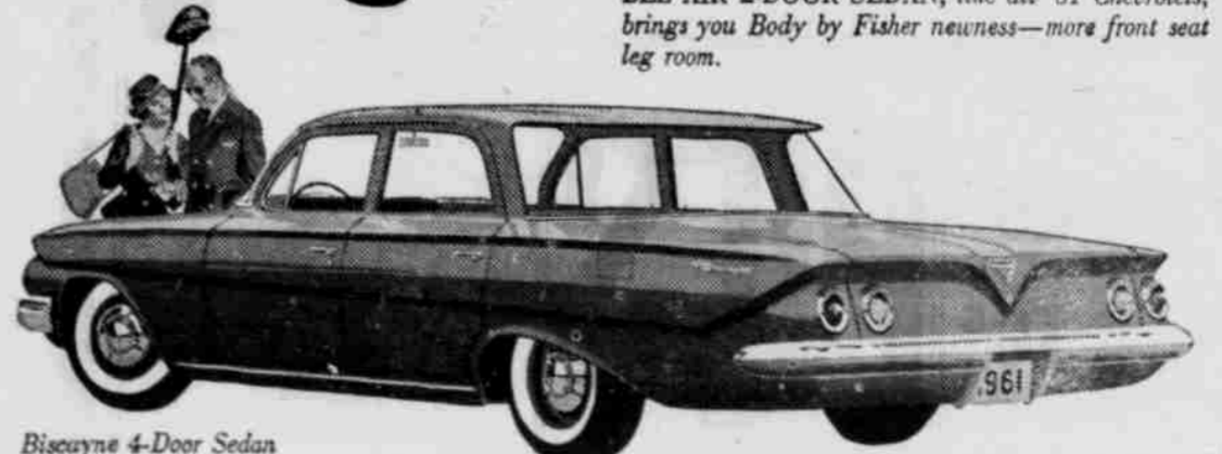
Biscayne 4-Door Sedan

See the new Chevrolet cars, Chevy Corvairs and the new Corvette at your local authorized Chevrolet dealer's