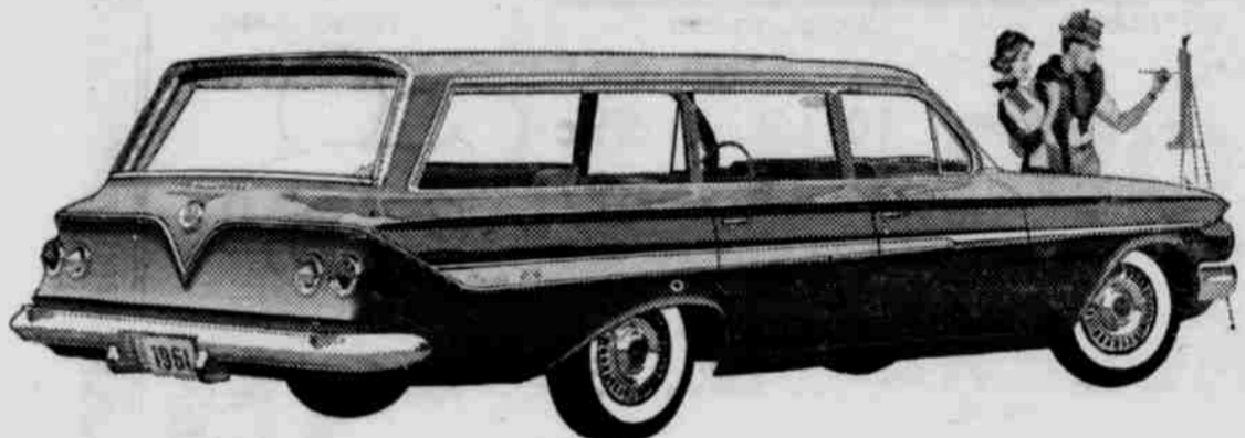
NOMAD 9-PASSENGER STATION WAGON. You have a choice of six Chevrolet wagons, each with a cave-sized cargo opening nearly 5 feet across.