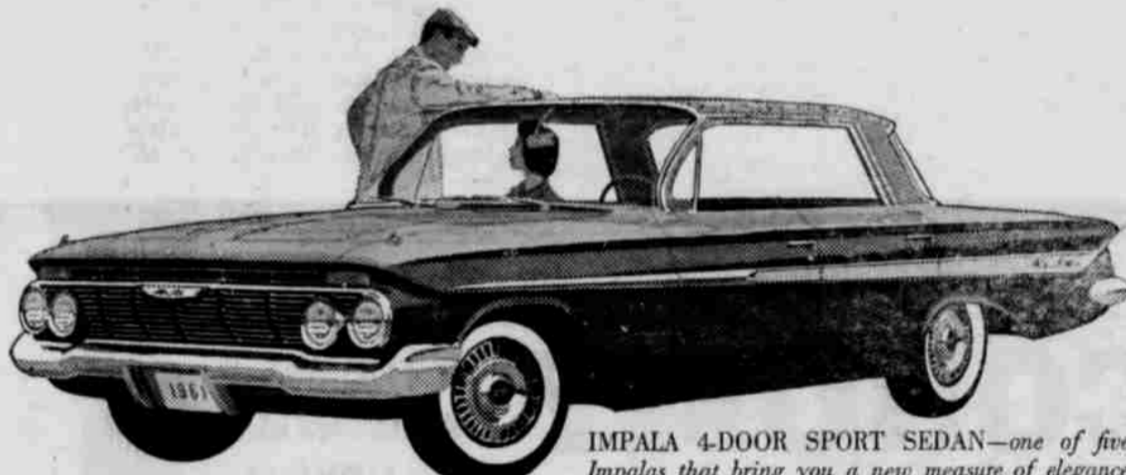
IMPALA 4-DOOR SPORT SEDAN—one of five Impalas that bring you a new measure of elegance from the most elegant Chevrolets of all.

Chevy's new '61 Biscaynes—6 or V8—give you a full measure of Chevrolet quality, roominess and proved performance—yet they're priced down with many cars that give you a lot less! Now you can have economy and comfort, too!