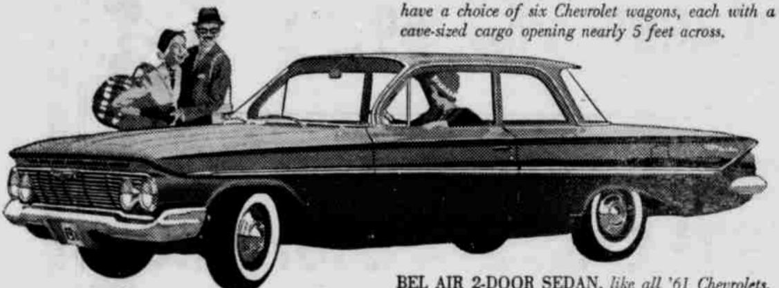
BEL AIR 2-DOOR SEDAN, like all '61 Chevrolets, brings you Body by Fisher newness—more front seat leg room.