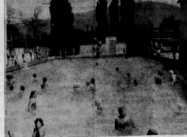
IT WAS A MAD RUSH when Heppner kids learned last Sunday that the city swimming pool was going to open that afternoon. This picture was taken less than five minutes after the doors were opened so the pool was only about half full of youngsters, but before the day was over, more than 200 had been checked in. Lessons will start in another week or so.