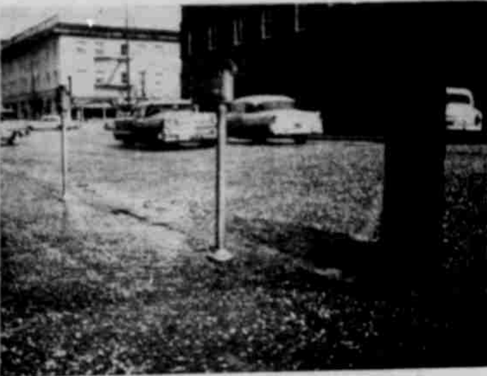
MAN SIZED HAIL fell for a few minutes Monday afternoon in Heppner and because of their size, it didn't take long to cover the streets with white ice balls. This picture was taken from the office door of the Gazette-Times while the photographer ducked stones that measured as much as three-quarters of an inch across.