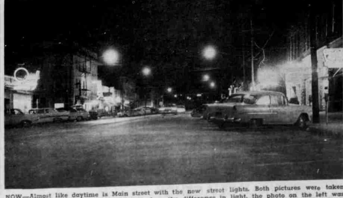
NOW—Almost like daytime is Main street with the new street lights. Both pictures were taken with the same camera setting and to show the difference in light, the photo on the left was exposed one minute, the one on the right just one second.