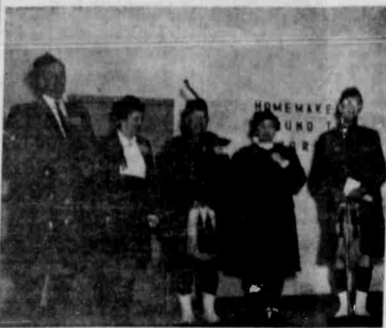
SCOTTISH DANCERS from Dayville entertained over 150 women at the annual Homemakers Festival last Friday at Heppner. The group entertained as part of the day-long program.