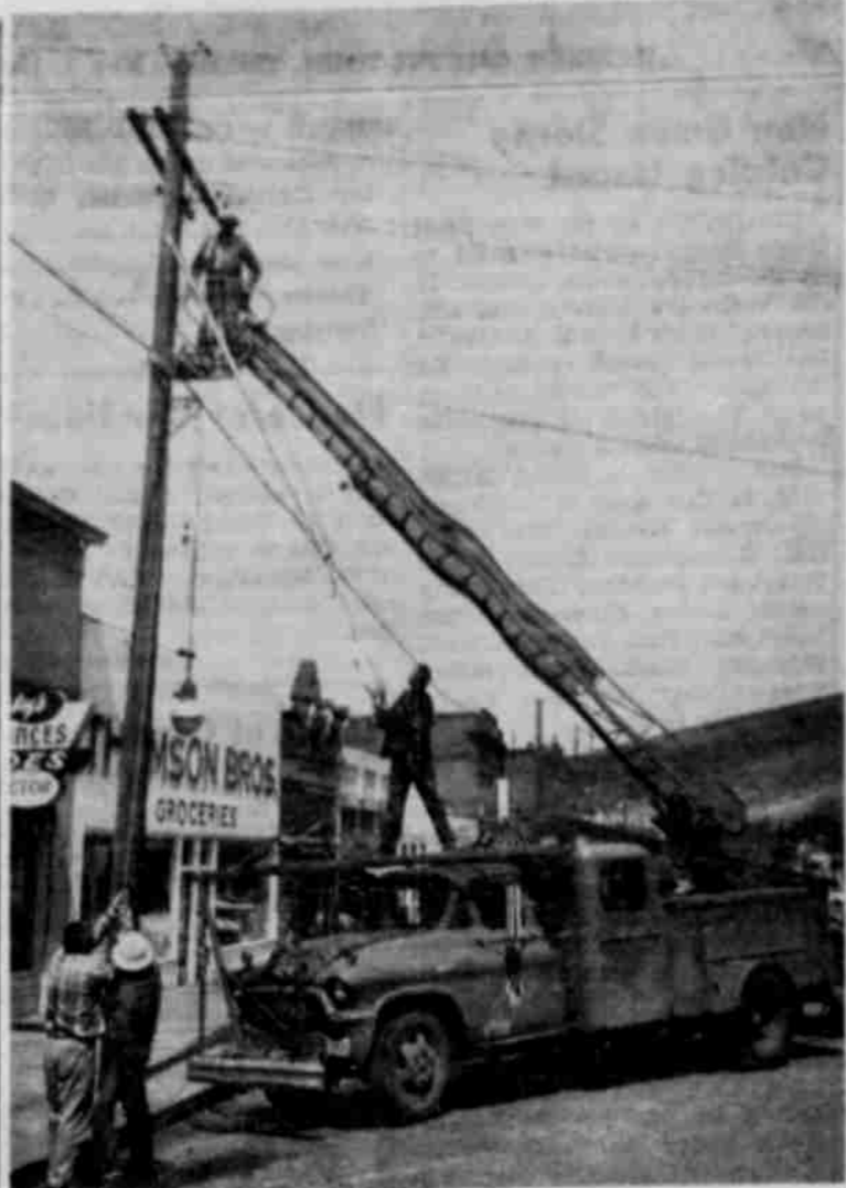
PP&L INSTALLS STREET LIGHTS—Crewman of Pacific Power & Light Company install one of the 17 new 21,000 lumen street lights on Heppner's Main street. Old light hangs from pole as the new illuminating device heads skyward. Final work on the project should be completed by the end of this week.

There are no restrictions on size, age, color, sex or anything else. Just have your frogs ready to jump at 5 p m Friday in front of the Heppner Hotel. Tally-80