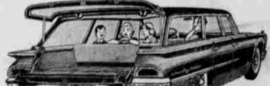
See the luxury interior of this 6-passenger Country Sedan