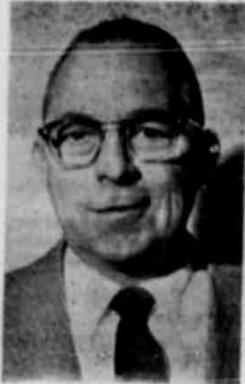
F. A. DAVIS