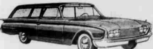
The 2-door Ranch Wagon—America's lowest-priced full-size wagon