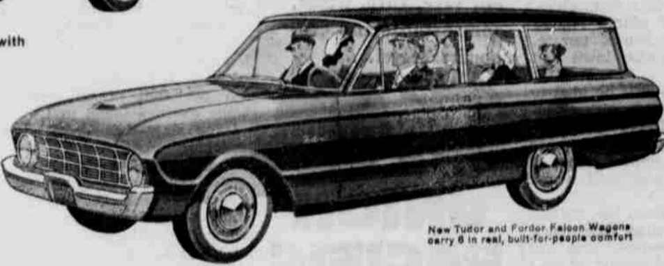
New Ford and Ford Falcon Wagons carry 6 in real, built-for-people comfort