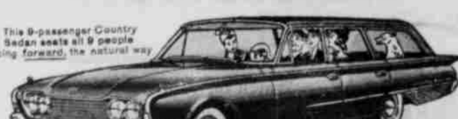
This 9-passenger Country Sedan seats all 9 people facing forward, the natural way