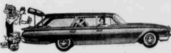
The Ford Ranch Wagon—with biggest loadspace in Ford's field

It's your widest choice... from America's Wagon Specialists America's "wagon boss" has done it again! Ford's put together the greatest wagon show on earth, so come in and feast your eyes on seven all-new wagon wonders. See cargo space galore! For instance, Falcon Wagon loadspace is almost 9 feet long with the tailgate down. Take a look at luxury! For elegant interiors, Ford Country Sedans and the magnificent Country Squire can't be matched. And inside all, there's room for 6 (room for 9 in some). And feast your eyes on these prices! You'll see America's lowest price tags for compact wagons, full-size wagons, too. Come in, see the savings for yourself. And while you're there, get your Ford Dealer's free appraisal... there's no obligation.