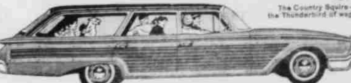
The Country Squire—the Thunderbird of wagons

SEE ALL SEVEN WAGON WONDERS AT YOUR FORD DEALER'S