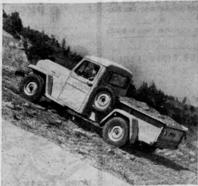
The 'Jeep' Truck