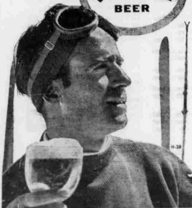
Visitors are always welcome to Olympia Brewing Co., Olympia, Wash. *Oly*