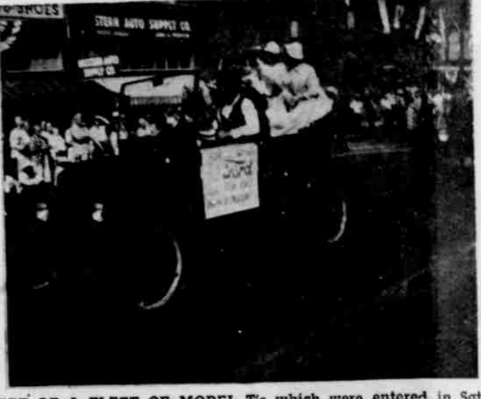
PART OF A FLEET OF MODEL T's which were entered in Saturday's parade by Bruce Motors. The entry won third prize in the business division.