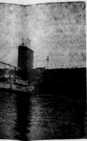
ER SUB-TERMINAL CUMBERLAND RIVER