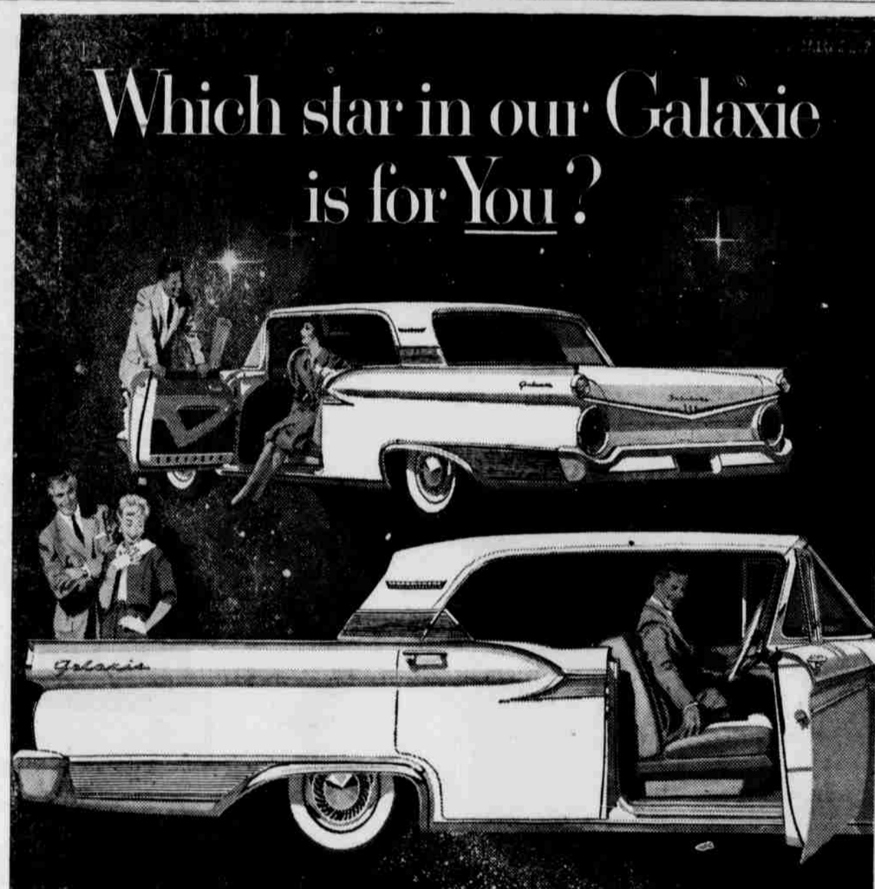
Top: The Galaxie Club Victoria hardtop... Bottom: The Galaxie Town Victoria hardtop

WE'VE GOT THE NEWEST (AND LOWEST-PRICED) LINE OF GLAMOUR CARS IN THE WORLD!