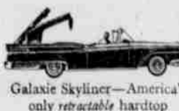
Galaxie Skyliner—America's only retractable hardtop