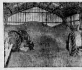
Combination grain and machinery storage doubles utility of Butler steel buildings. Bins and partitions available.