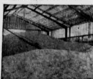
In weather-tight, rodent-proof Butler steel buildings, your wheat crop is spread out, not piled deep.

STORE WHEAT FLAT at LOWEST COST per BUSHEL