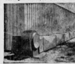
Butler Farco-Aire dries wheat in storage, at lowest cost per bushel. You can harvest earlier, reduce field losses.