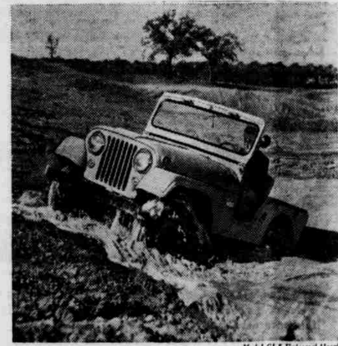
Model CJ-3 Universal 'Jeep'